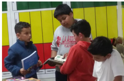
Girl Scout Juniors attending Carmel River School earned their Bronze Award by